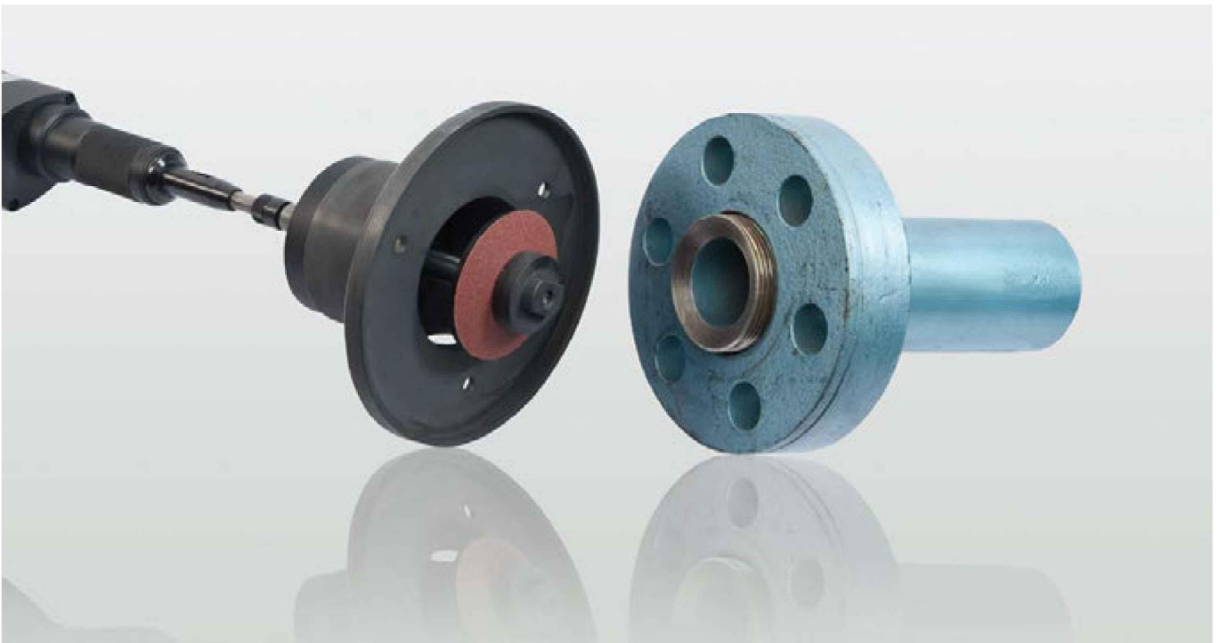
EFCO-LS with guide bush

Precise special guides provide for completely centred machining of the sealing face.